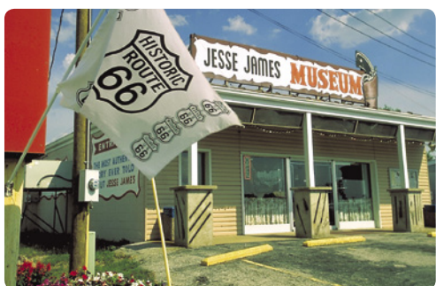
Jesse James Museum, Stanton, Missouri

Day 12/13 > Enjoy the city that never sleeps – Las Vegas! The campground next to Circus Circus is right on the Strip which is also home to New York & Paris! 100 miles ★ Spend the day wandering the Strip and then enjoy one of the many world class acts or shows like Cirque du Soleil. If time permits a visit to the Fremont Street experience is a must with free live entertainment and the amazing light show! TIP! Extend your stay for a few nights and head to Zion, Bryce Canyon and the National Parks of Utah. https://goo.gl/4LRExc