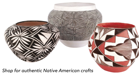
Shop for authentic Native American crafts

Amarillo visit the American Quarter Horse Heritage Centre, Cadillac Ranch & the Route 66 historic district featuring antiques, boutiques and eclectic dining. 325 miles ★ Experience Palo Duro Canyon up close and personal, the way the cowboys did: On Horseback. The Old West Stables, located inside the canyon, offers guided tours. If you are heading to Cadillac Ranch be sure to grab some spray paint & enjoy creating your own piece of artwork!