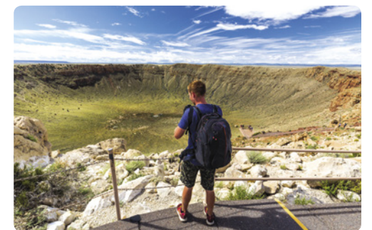
Visit Meteor Crater, Flagstaff