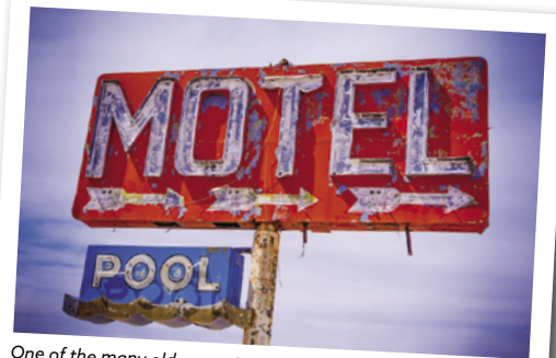
One of the many old neon signs along Route 66

Day 9/10 > It is a long drive today as you head for Williams KOA, the gateway to the Grand Canyon, where you are booked for two nights! En route be sure to stop off at Gallup, which some say is the 'Indian capital of the world' because of its location in the centre of Native American lands. Once you are at Williams KOA you have three choices for going to the Grand Canyon. Take the hour's drive