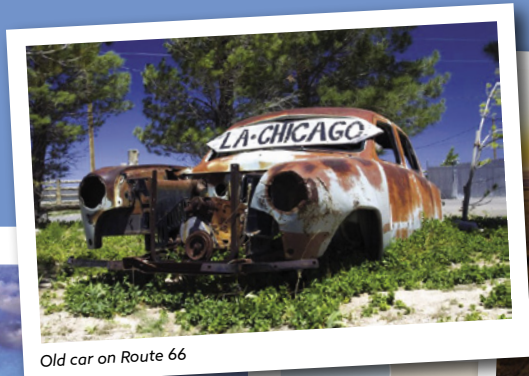
Old car on Route 66