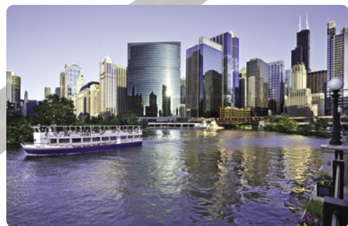
Chicago River and Willis Tower

Day 3 > Today you are heading through America's heartland and to Tulsa. Make sure you stop off in Joplin, once a hide out town of that famous duo, Bonnie & Clyde! Vibrant Tulsa was once known as the 'oil capital of the world' and is now home to the world's largest collection of art and artefacts of the American West, superb collections of European art and the fabulous Brady Arts District,